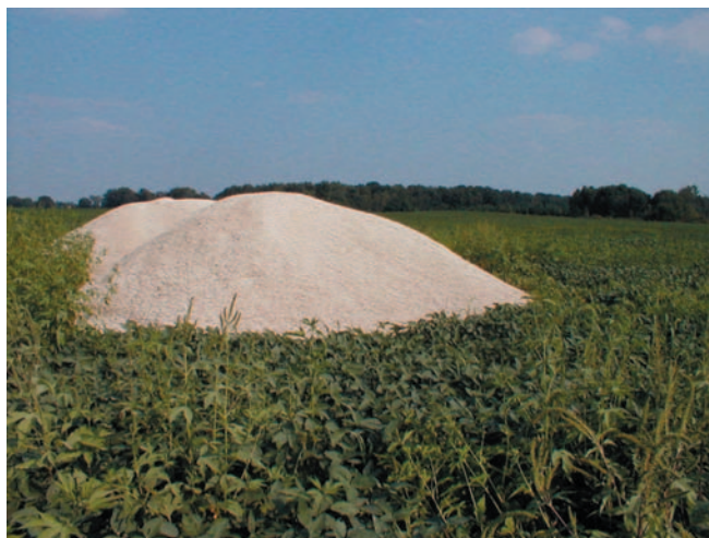
Figure 3. Gypsum stockpiled in the field for post-harvest application.

The cost and ease of land application are heavily dependent on factors such as water content, particle size, and purity of the gypsum product. The samples collected for this study included products taken directly from the sources as well as materials stockpiled in the field in preparation for land application (Figure 3). As a result, the water contents varied considerably (Table 2). Water content was consistently small ( < 1\% ) for the mined gypsum and the recycled cast material, neither of which were exposed to rainfall. Water contents of the synthetic FGD-gypsum were below 10%, even though the manufacturer reports that the product has an average water content of 12%. Drywall gypsum contained 1% water at the recycling facility, whereas contents were as high as 19% after storage in the field.