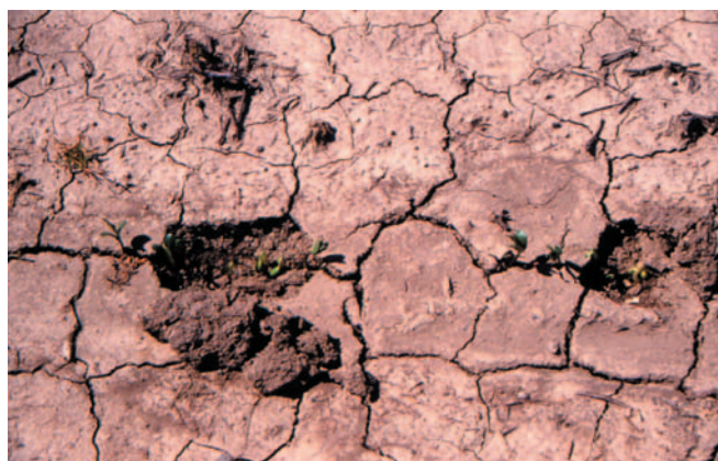
Figure 1. Inhibition of soybean seedling emergence by severe surface crusting.

The objectives of this fact sheet are to review possible sources of gypsum for agricultural use in Ohio, and to report results from chemical and mineral analyses of representative samples.