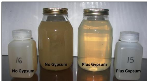
Water samples from control and treated fields.

One such tool is calcium sulfate (gypsum), and a study underway in Ohio is yielding extremely promising results after just the first use. Gypsum is a naturally occurring mineral that has been recognized for its benefits to agriculture for hundreds of years. It is also a byproduct of flue gas desulfurization (FGD) systems, or the coal-fired power plant “scrubbers” that have been installed in many plants to remove sulfur from their exhaust and reduce acid rain.